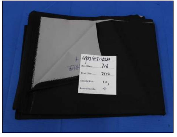
SGS authenticate the photo on original report only ***End of Report***